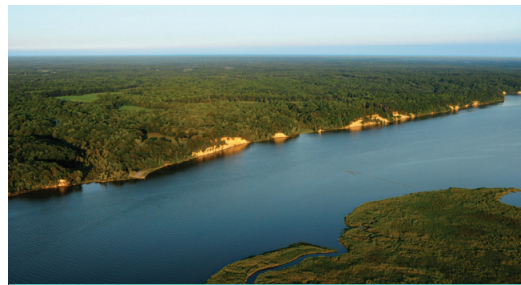
Fones Cliff, Rappahannock River Valley National Wildlife Refuge

Short Description: Established in 1996, the Rappahannock River Valley NWR is still less than halfway toward its goal of protecting 20,000 acres of habitat vital to the American bald eagle, American black duck, and numerous other species that are conservation priorities. It is also a place where in 1608 English explorer John Smith first encountered the Rappahannock Tribe, whose legacy remains largely unresearched along the river that bears their name. Over 20+ years, a $18m investment from LWCF has protected nearly 6,000 acres along the Rappahannock, with many areas open to fishing, hunting, environmental education, and wildlife observation.