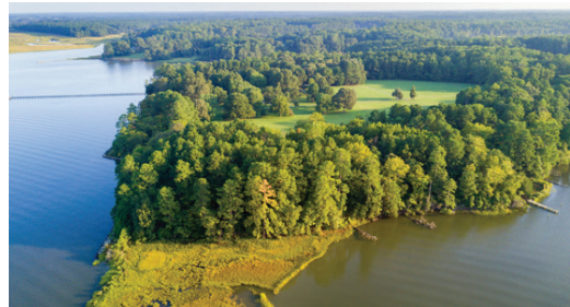
Werowocomoco

Short Description: The Chesapeake Trail, America's first national water trail, traces the explorer's route through coastal VA and MD, and up the Nanticoke River into DE. Werowocomoco is an internationally significant cultural and archeological site on the York River, believed to have been a place of leadership and spiritual importance to American Indians as early as circa AD 1200. At Werowocomoco, Powhatan, the leader of many Algonquian tribes, lived and subsequently met on several occasions with Captain John Smith in 1607 in the earliest recorded meetings between a Native leader and the English. In partnership with The Conservation Fund, Chesapeake Conservancy, and others, LWCF funds purchased 264 acres of land in Gloucester County, Virginia, encompassing this historic site as part of the Chesapeake Trail.