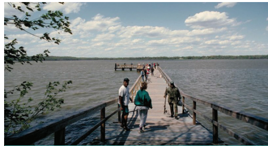
Visitors fish from a long pier on the Potomac River in Piscataway National Park

Short Description: The view across the Potomac from Mount Vernon was first targeted for protection as a pilot project to protect parklands from suburban sprawl. Piscataway Park was conceived in 1952 to preserve the river view as it existed during George Washington's day. Since that time, numerous organizations have joined in partnership with the NPS to ensure the protection of the historic viewshed. Federal LWCF funding provided to Piscataway Park has allowed the NPS, the Mount Vernon Ladies' Association, private conservation groups, willing landowners, and other partners, to protect 232 acres of critical shoreline since 1995. Other area properties have been protected but several remain vulnerable to development or other view-spoiling uses.