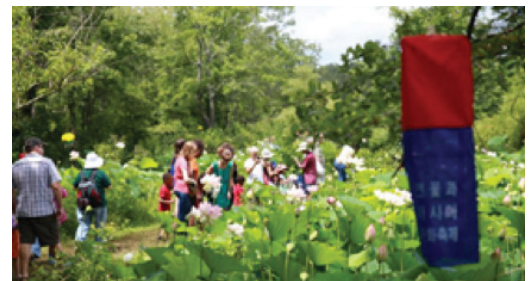
Annual lotus and lily festival

Short Description: Visitors and residents of Washington, D.C. experience the natural habitat of the area at the beautifully preserved Kenilworth Aquatic Gardens. This wetland helps mitigate pollution, reduces flood damage, and alleviates risks from climate change. As part of the National Capital Parks East, this park which has hiking trails, boardwalks, and comprehensive environmental education resources, has received a portion of the $2.5 million of LWCF awarded to the District's network of parks. In addition to many events over the year, members of the D.C. Garden Club plant thousands of lotus each spring, a one-of-a-kind spectacle that draws visitors from across town and around the world.